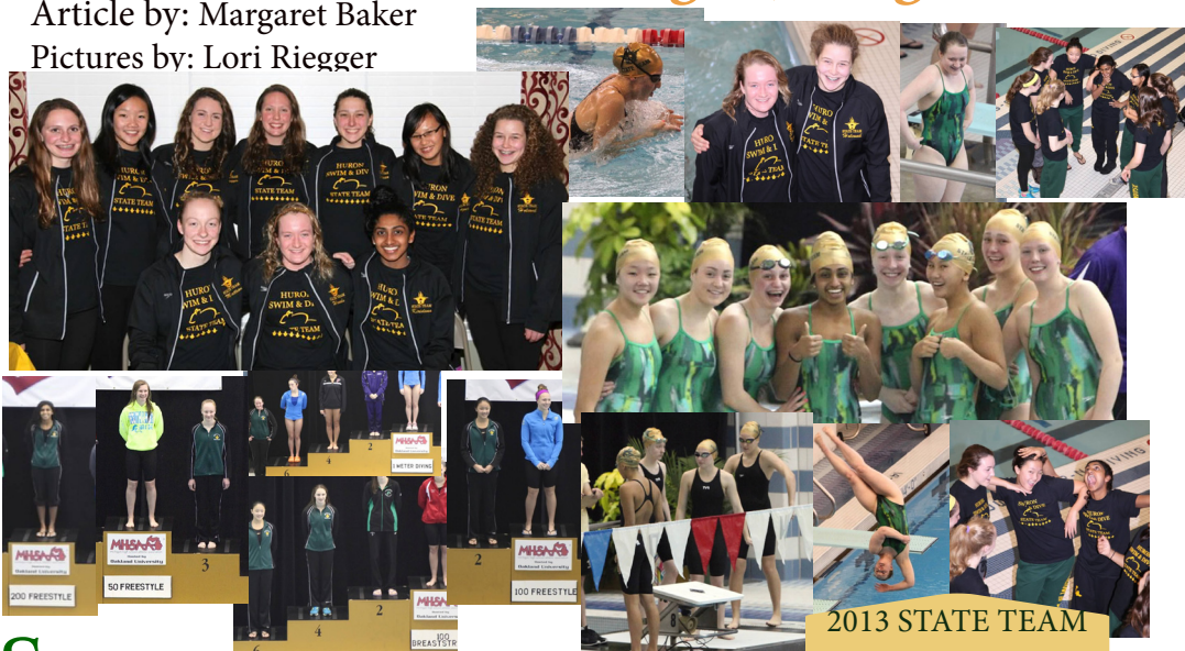
2013 STATE TEAM

S tate Meet had some really fast swimming and great diving. Huron did awesome and the coaching staff was proud of every girl and their performance at the meet. Huron placed 16th with 55 points. Compared to last year's results we scored 3 more points with more individual top 16 swimmers & a top 8 diver. (2012 ~ 15th with 52 points – top 16 relays and diver).